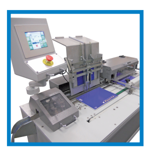
Touch screen and closing system.