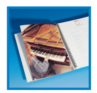
Sample bound using the WB-450.